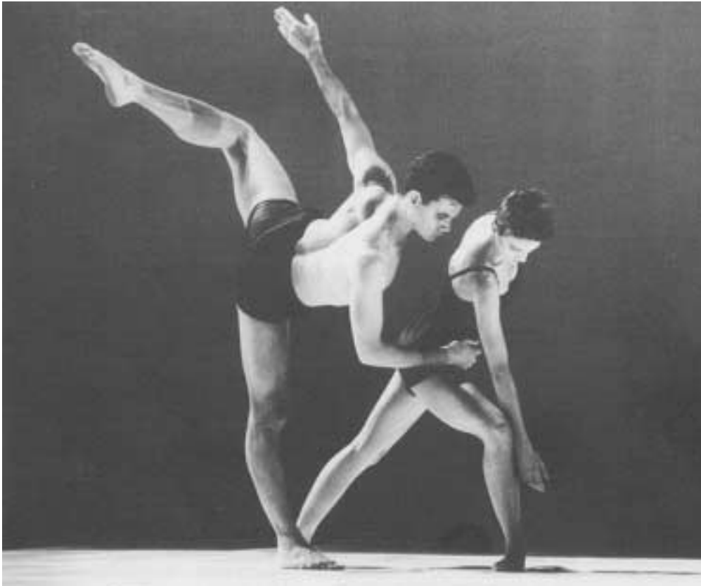
Strong Language, 1987