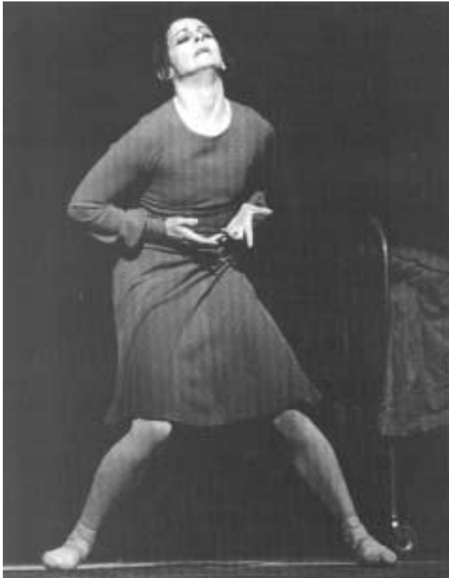
Anastasia , 1971