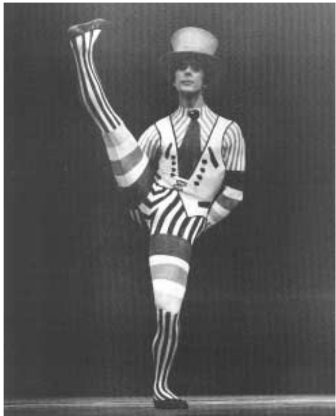
Elite Syncopations , 1974