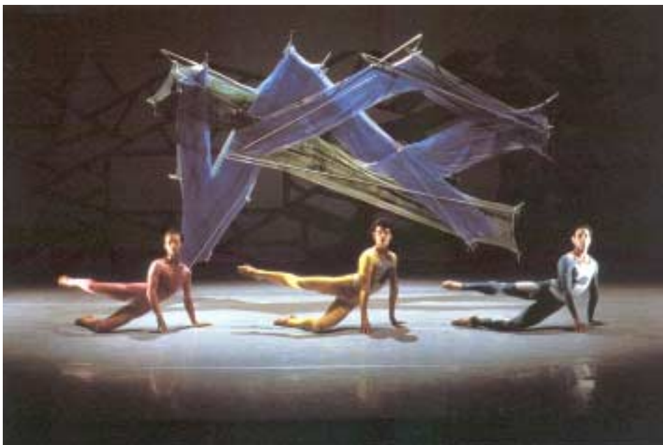
Wildlife , 1984