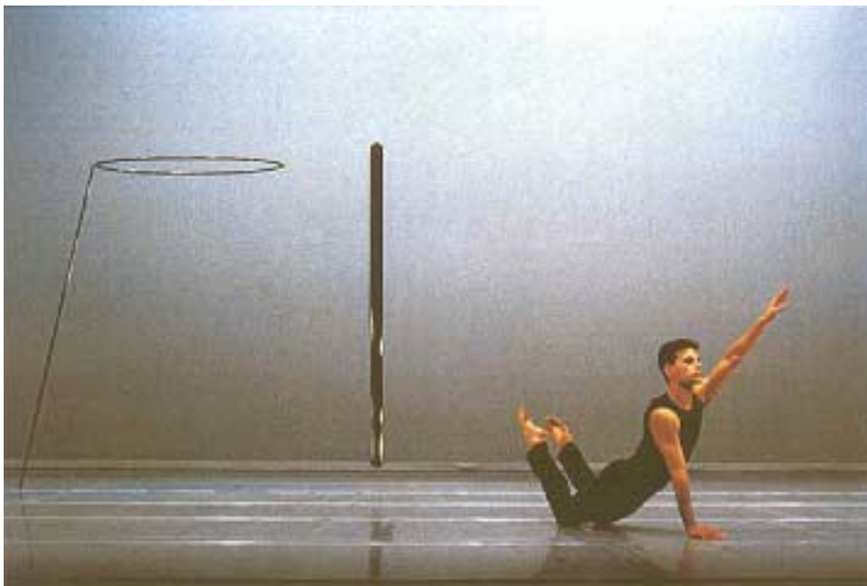
Soda Lake , 1981