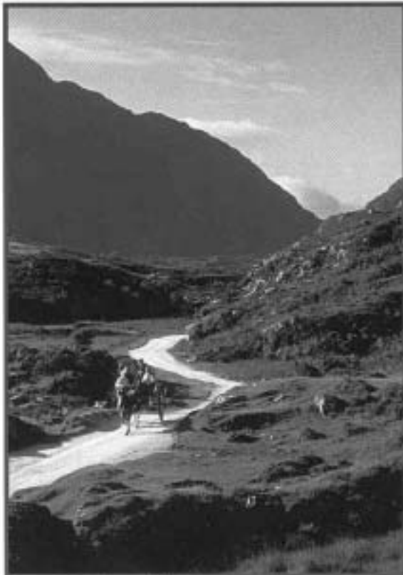
Gap of Dunloe, Killarney.

The Blue Pool Nature Trail in Cloghereen Wood close to Muckross village goes through woodlands planted with a great variety of coniferous and deciduous trees and is inhabited by many birds and other animals. The trail goes around a small lake, a part of which is the beautiful Blue Pool after which the trail is named. The Trail is almost 2km long.