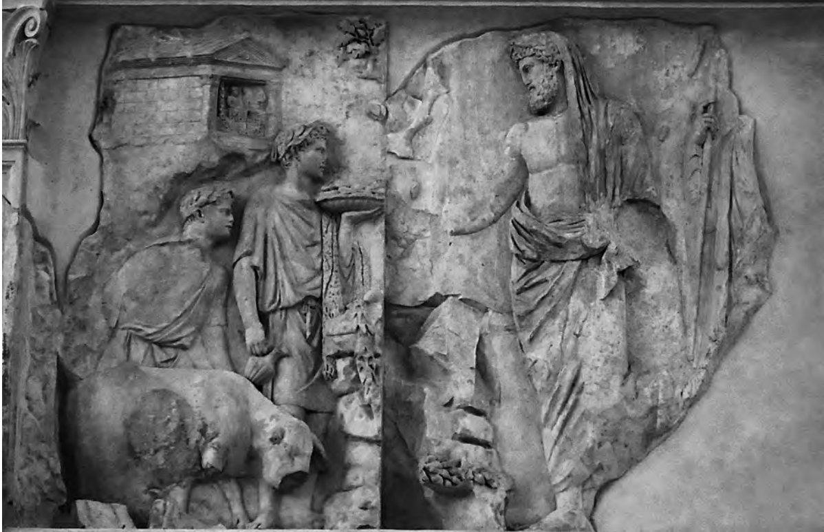
A panel of relief sculpture from the Ara Pacis Augustae .

1 Study the image below, and answer the questions which follow: