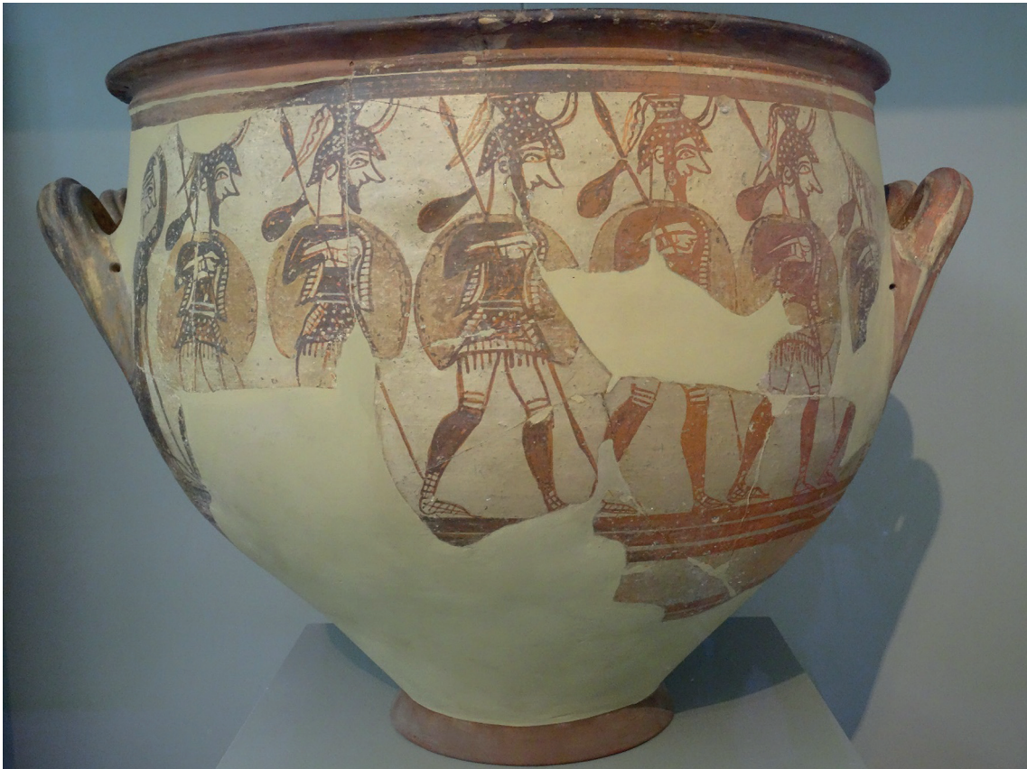
The Warrior Vase from Mycenae

1 Study the photograph and answer the questions.