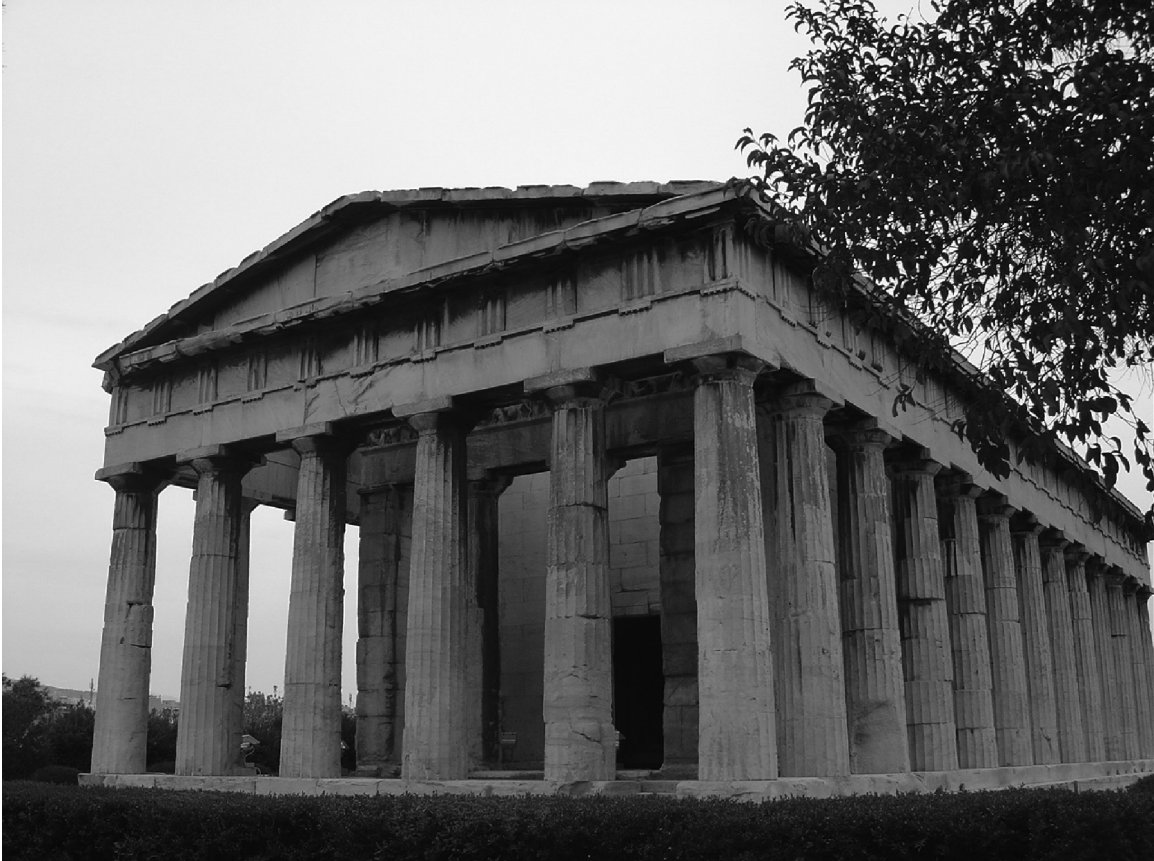
Temple of Hephaistos, Athenian Agora

2 Study the photograph and answer the questions.