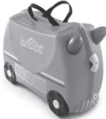
The Trunki suitcase