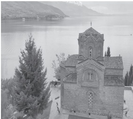
Lake Ohrid is a popular tourist destination

Macedonia is only just beginning to exploit its tourism potential. It boasts great natural beauty, but is still largely unknown outside Eastern Europe. Its transport and tourism infrastructure is largely undeveloped.