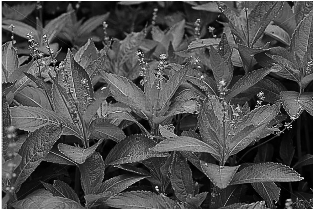
Magnification \times 1.0

3 The photograph below shows Mercurialis perennis , a plant found growing in woodland.