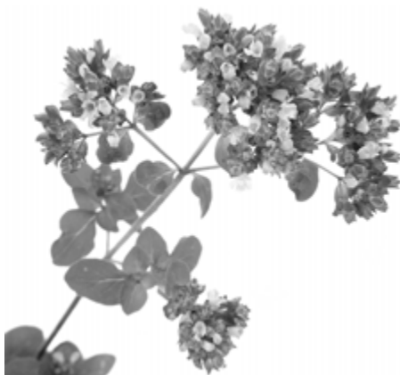
Magnification \times 1