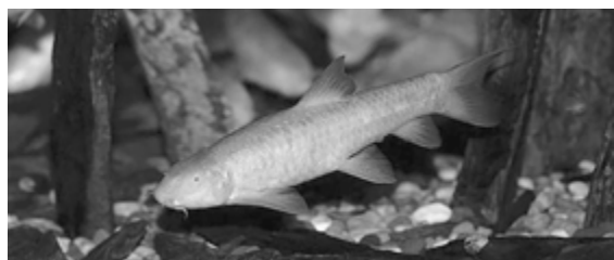
Magnification \times 1.5

2 The photograph below shows Garra barrimiae , a species of fish that feeds on aquatic plants.