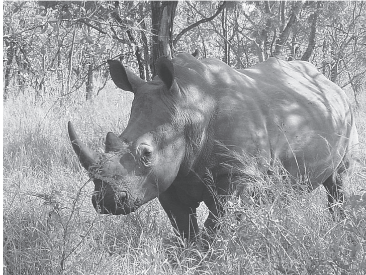
White rhino Magnification \times 0.02

The white rhinoceros, Ceratotherium simum , is an example of a mammal that is threatened with extinction.