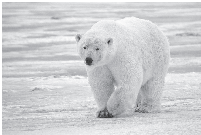
Polar bear Magnification \times 0.04

A recent study has shown that all polar bears are descended from populations that diverged from the Irish brown bear, Ursus arctos , approximately 120 000 years ago.