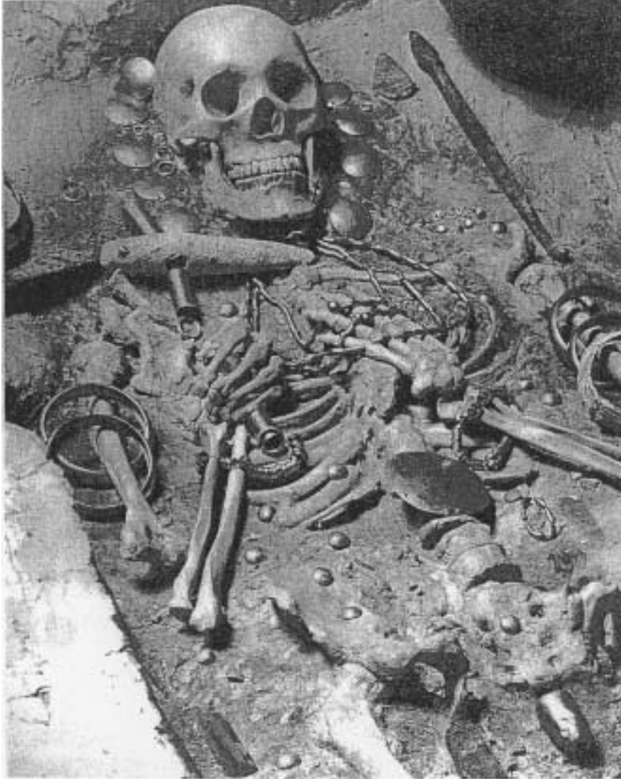
Figure 1 'The grave of the Golden Penis': Varna cemetery, Bulgaria. c4000 BC