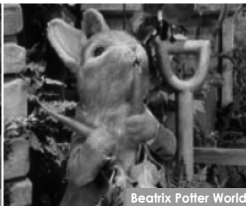
Beatrix Potter World