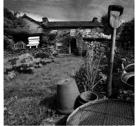
Hill Top, Cumbria: Beatrix Potter's house

Getting here: 2 miles south of Hawkshead, in hamlet of Near Sawrey; 3 miles from Bowness via ferry. Foot: off-road path from ferry (2 miles), marked. Bus: Cross Lakes Experience from Bowness Pier 3 across Lake Windermere on to Stagecoach in Cumbria 525; also 505 from Windermere changing at Hawkshead (April–September only, plus weekends in October). Telephone 01539 445161 for complete ferry and bus timetable. Train: Windermere 4½ miles via vehicle ferry. Road: B5286 and B5285 from Ambleside (6 miles), B5285 from Coniston (7 miles). Parking: limited car parking.