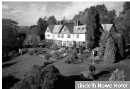
Lindeth Howe Hotel