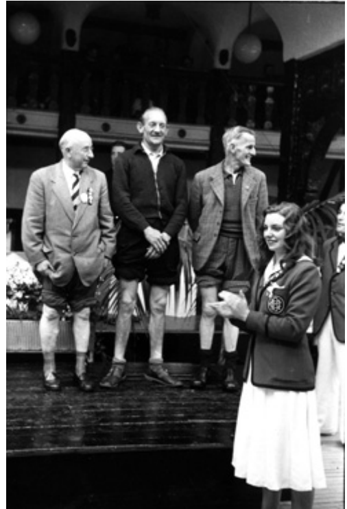
Knobbly knees competition