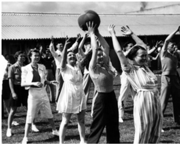
Games and races