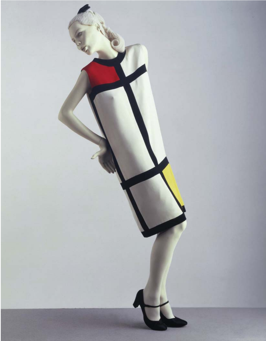
(a) Dress from the YSL collection, Yves Saint Laurent, 1965 (Mondrian story).