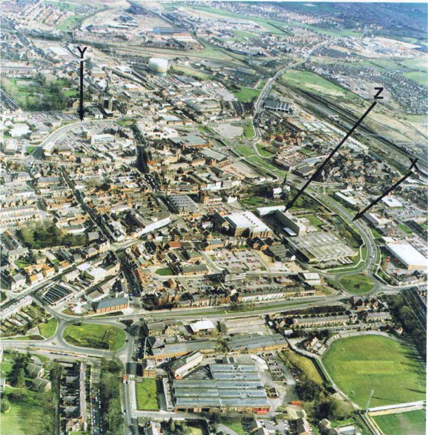
Figure 3: Darlington Town Centre