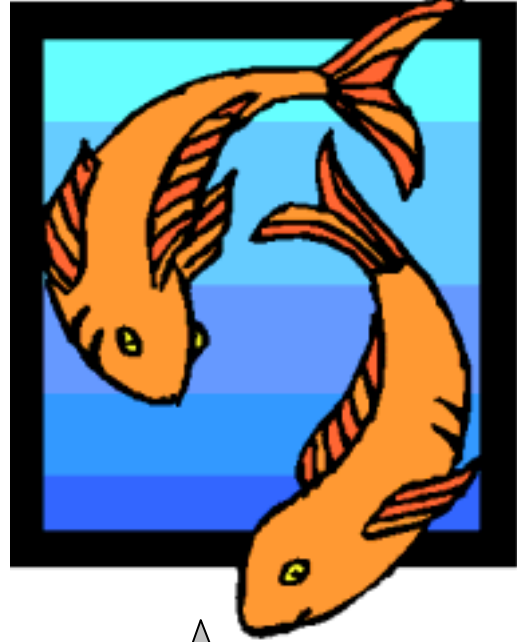
Image of any fish inserted It may also be a lake, pond or ocean picture Placed top right of page Graphic area no more than 40% of printed page and no less than 10% of page Orientation of graphic not important Text must wrap around all the image

Portrait page orientation All margins 2cm Allow for paper feed inconsistencies with printers – (the line length must be between 16.75 and 17.25 cm)